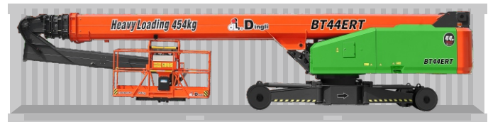
Standard Container Transport